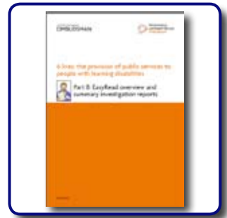
'Six Lives' Report