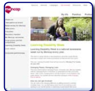
Learning Disability Awareness Week