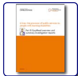
'Six Lives' Report