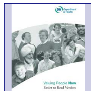
Valuing People Now