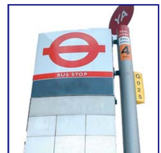
People wanted more help with transport