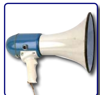
Have your say

Some service users had been to the National Forum meeting on 28 May. The forum looks at what is happening in Learning Disability services and gives feedback. We need a rep for Greenwich for this. One of the workshops looked at personalisation and another at advocacy . These asked whether this service was working well and whether any groups were being left out.