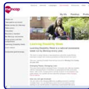
Learning Disability Awareness Week

There will be an art exhibition and a display at the Town Hall.