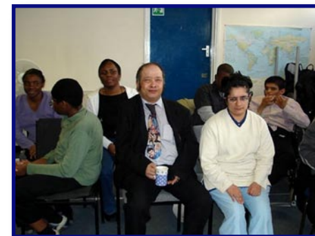
Greenwich Service Users