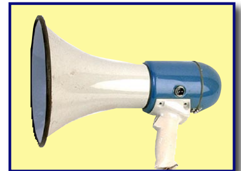
Tell us what you think!