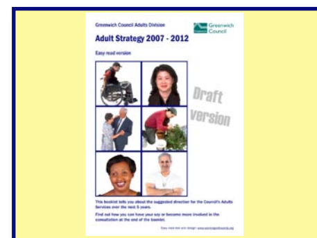
The Adult Strategy