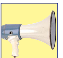
Have your say!